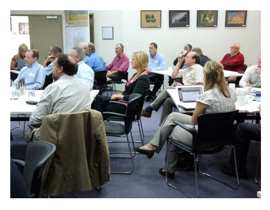
Figure 2. Think tank participants during a presentation