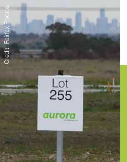
April 2011 Climate Adaptation for Decision-Makers

Climate Adaptation for Decision-Makers is published by the Victorian Centre for Climate Change Adaptation Research (VCCCAR). The series identifies policy issues emerging from VCCCAR research to inform decision-makers with responsibility for climate adaptation policies at local and state levels of government. Information on publications in this series and the research on which they are based can be found on the VCCCAR website at www.vcccar. org.au.