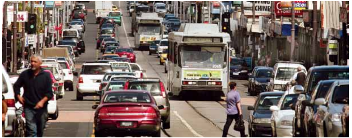
Sydney Road, Brunswick: Melbourne's inner suburbs have many attractions but pose adaptive challenges.

Designing energy and water infrastructure without understanding and incorporating wider system characteristics may limit infrastructure and community resilience. A focus on improving the robustness of technical hardware to climate change impacts may inadvertently restrict the capacity of end-users to adapt. Or it may create barriers to further learning – stifling needed innovation. Energy and water systems that foster interaction between end-users, managers, resources and technical hardware are likely to have greater capacity for self-organisation, learning and adaptation. What is unknown is whether certain responses to climate change can also reduce the resilience of energy and water systems over the long term. Such responses are considered 'maladaptive'.