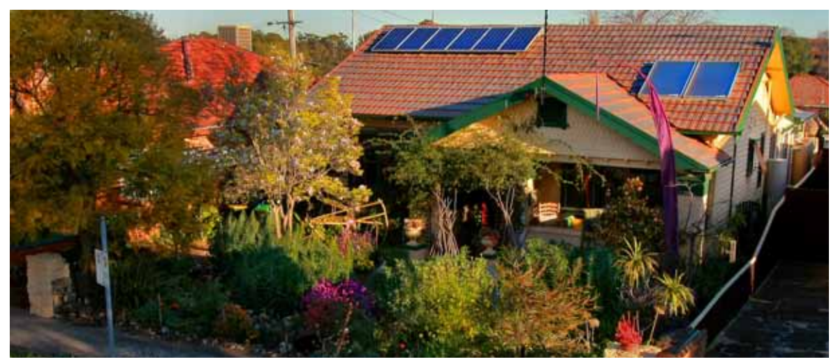
Adaptive challenges and opportunities #1: retro-fitting water and energy systems into older housing stock.